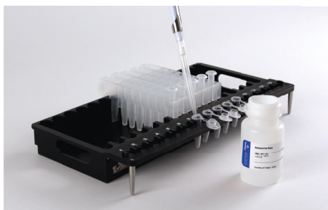
Figure 2. Setup and configuration of the deck tray(s). Elution Buffer is added to the elution tubes as shown. The plunger is in well #8 of the cartridge.