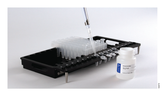
Figure 2. Setup and configuration of the deck trays. Nuclease-Free Water is added to the elution tubes as shown. Plungers are in well #8 of the cartridge.